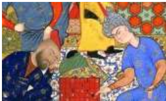
Two men playing chess, 16 th century Persian (see [13])

It seems that the game was played with a number of dice or pieces, a large one "bull" and a few small ones "cows." The game is not identifiable, but dice games gave rise to the need of calculating odds of winning and thus set the stage for the development of the modern mathematical area of Probability. This game is of mathematical interest in another way as well, since it appears to be a board game played with a number of pieces, and as such has some similarity, and perhaps is a precursor, to chess. It is generally believed that the game of chess originated in India. The Indian Sanskrit name for chess was "shatranja," meaning four "anga" (detachments) following the arrangement of the troops in the Battle of Kurukshetra described in the Mahâbhârata . The game was originally played with four armies and a dice [6]. Chess is a particularly mathematical game, but all games involving strategy, contributed to the development of the modern branch of mathematics called Game Theory, which is concerned, among other things, with determining winning strategies. It is rare to find references to games in ancient manuscripts. Perhaps the earliest such mention is a reference to "draughts" (checkers) in The Papyrus of Ani, The Egyptian Book of the Dead (c. 1400 BC) [5], where the title of Plate VII reads: "...the forms of existence which pleased the deceased, of playing at draughts and sitting in the Seh Hall. ...."